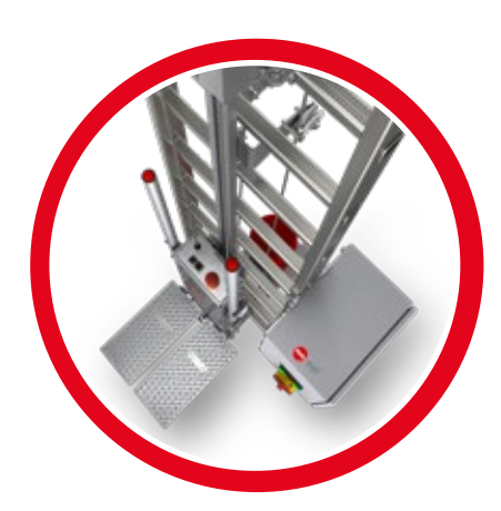
CLIMB ASSISTS AND ACCESS PLATFORMS

High quality rungs with patented beading and a special anti-slide profile ensure that the quality of our ladders is well-known worldwide. Our rail- and rope-based fall arrest systems offer maximum safety and are also available pre-assembled.