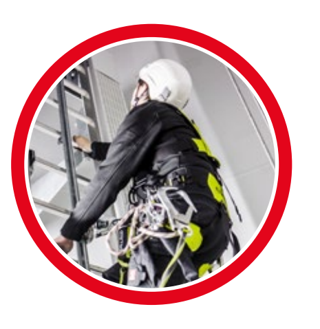
LADDER AND FALL ARREST SYSTEMS

We develop service lifts precisely customized to your requirements. Thanks to our comprehensive expertise, all our ladder- and ropeguided service lifts are characterized by their reliability, quality, smart design and low life-cycle costs.